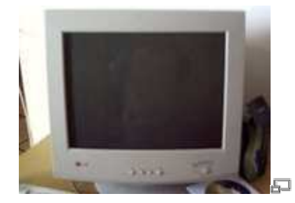
Figure 1.1 - A CRT Monitor

What is a computer? A computer is a machine that inputs (takes in) facts and information (known as data), and then processes (does something to or with) it. Afterwards it outputs, or displays, the results for you to see. Data is all kinds of information, including, pictures, letters, numbers, and sounds. There are two main parts of computers, hardware and software. Hardware is all of the parts of the computer you can see and touch. Software is the instructions that a computer uses to do what you ask it to. Pieces of software are often called programs.