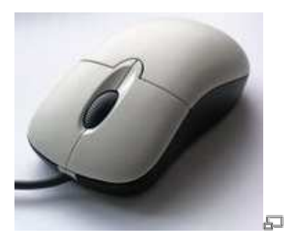
Figure 1.5 - A Mouse