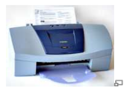
Figure 1.4 - A Printer

There are different styles of monitors. One of these is the one already shown. It is called a CRT monitor. It takes more power than the other popular kind, called LCD s (see Figure 1.3). However, CRT monitors work faster, which makes them better for fast games because the movement will blur less. LCDs are thinner than CRTs, but they are more expensive.