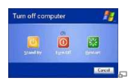
Figure 1.8 - Turn off Screen

NOTE: For the rest of this book we will only be saying 'Enter', if your keyboard says 'Return', just remember that they are the same thing.