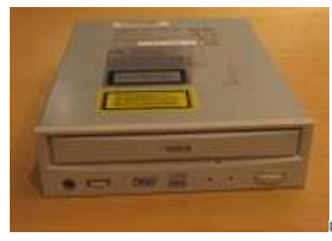
Figure 4.5 - a CD drive

Compact Discs CDs are the most popular form of optical discs.